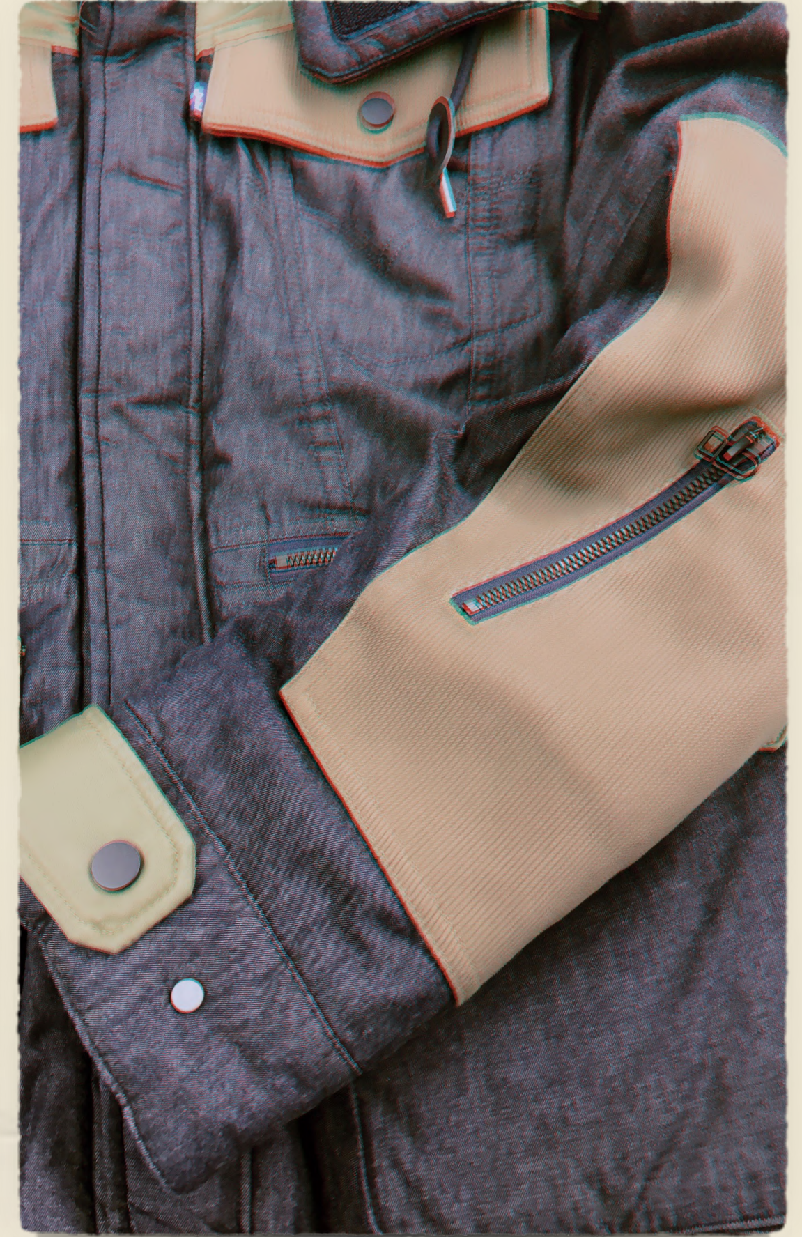
Accents & Details : Sleeves & Cuffs