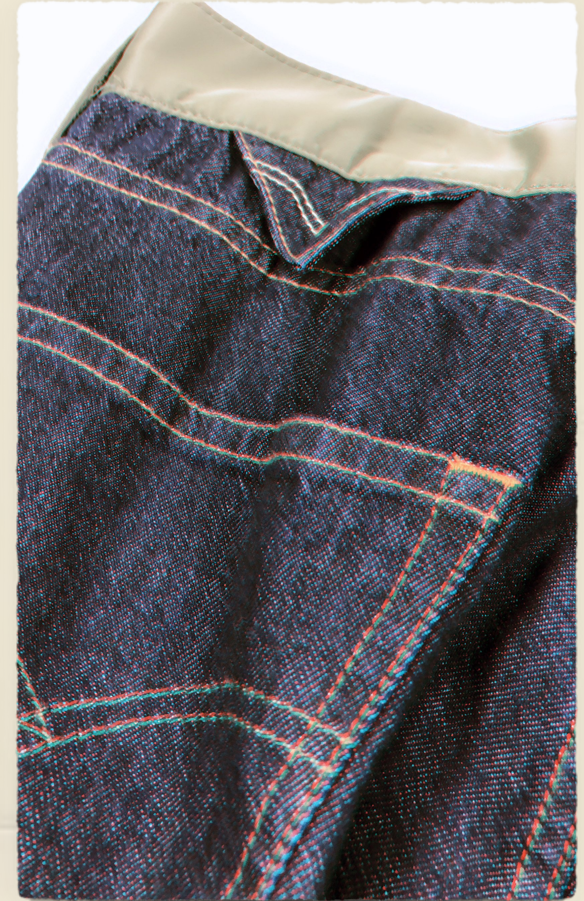
Accents & Details : Bottoms