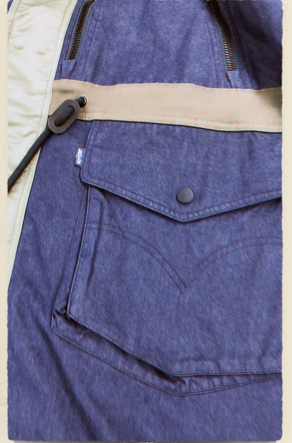
Accents & Details : Plackets & Pockets